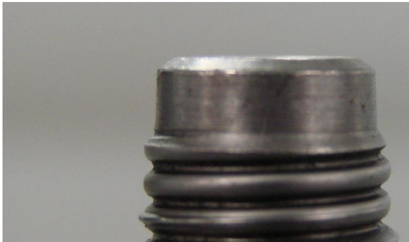
MAThread added to ISO flare fitting.

MAThread Transition thread Standard ISO thread