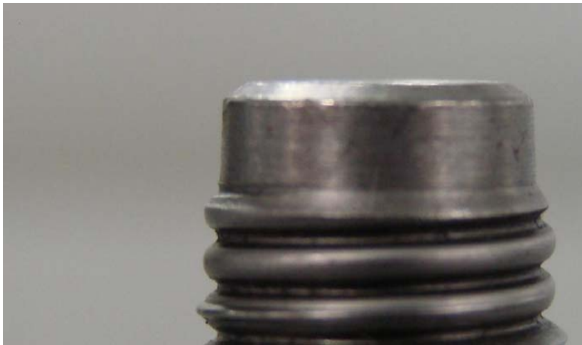
MAThread added to ISO flare fitting.

MAThread Transition thread Standard ISO thread